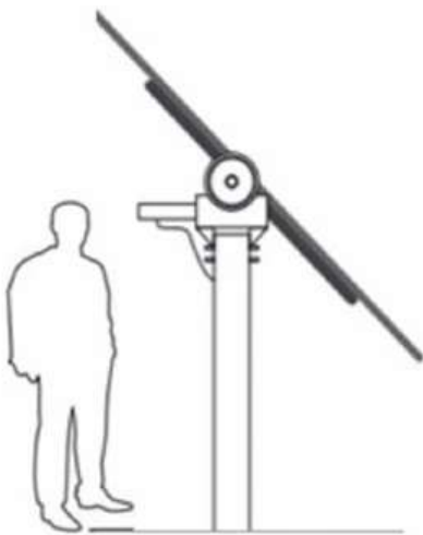
Artist's Impression of Solar Farm Panel & mount

It isn't expected that the solar panels would create any glint or glare hazards as they panels are designed to capture light, however FRV is conducting a detailed visual study.